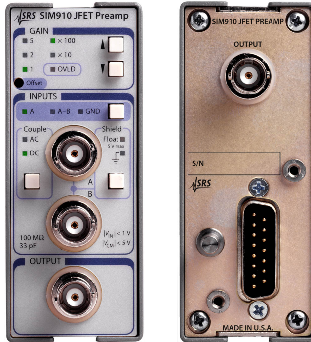
Figure 1.2: The SIM910 front and rear panel.

gain settings, the overload light, the input settings, the coupling and the shield states, and the buttons to control them.