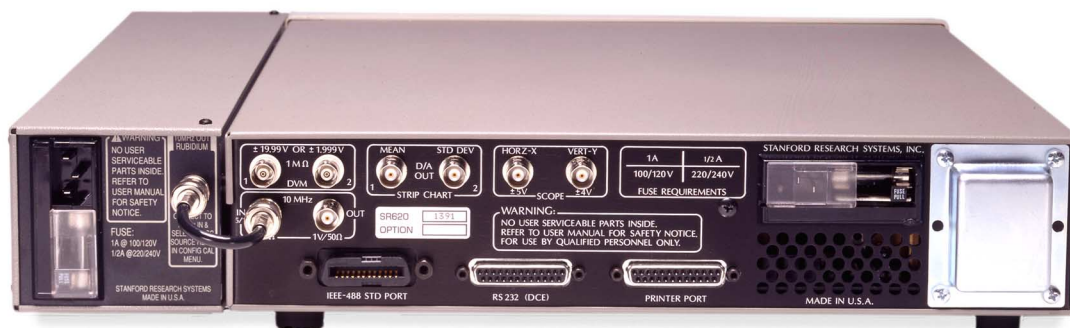
SR625 rear panel