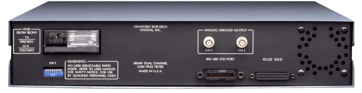
SR640 rear panel

SR640 Two-channel low pass filter with RS-232, GPIB and rack mount kit Two-channel high pass filter with RS-232, GPIB and rack mount kit One high, one low pass filter with RS-232, GPIB and rack mount kit Option 01 High current output