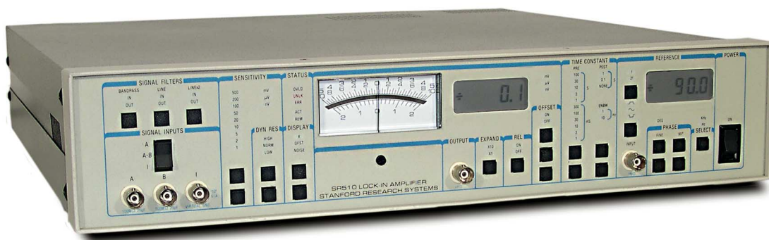
SR510 Lock-In Amplifier

An internal voltage-controlled oscillator provides both an adjustable-amplitude sine wave output and a synchronous, fixed-amplitude reference output. The sine wave amplitude can be set to 0.01, 0.1 or 1 Vrms, and it can drive up to 20 mA. The oscillator frequency is controlled by a rear-panel voltage input and can be adjusted between 1 Hz and 100 kHz. Typically, the sine wave output is used to excite some aspect of an experiment, while the reference output provides a frequency reference to the lock-in.