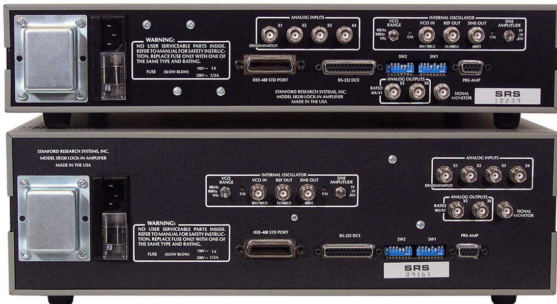
SR510 and SR530 rear panels (with opt. 01)