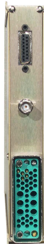
SR255 rear panel