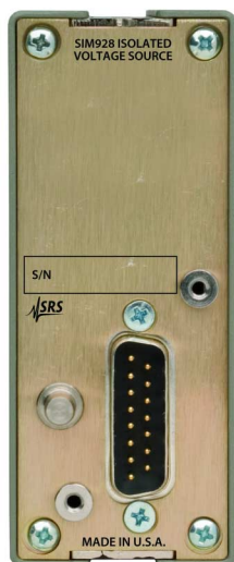
SIM928 rear panel