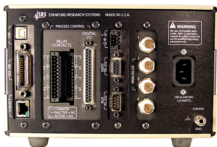
PPM100 rear panel

An embedded web server connects the PPM100 to the world wide web (password protected). The EWS can deliver measurement data to any standard internet browser. Use the EWS to monitor and control your vacuum system or to get automatic email notifications of potential or real system problems.